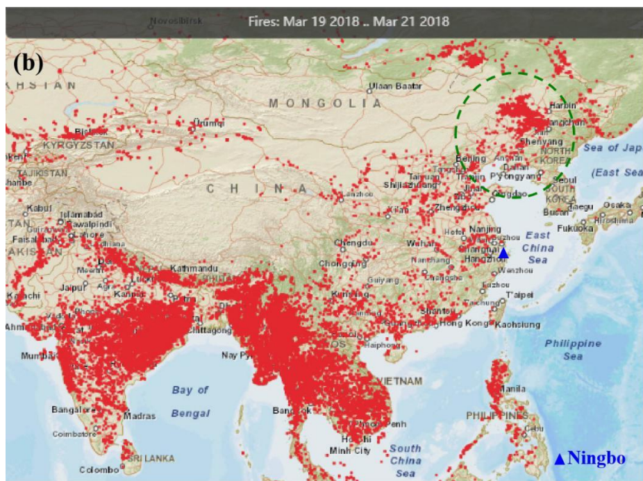
Fig. S2 Fire map in (a) March 2018 and (b) March 19~21, 2018. The study region is marked by blue triangle. https://firms.modaps.eosdis.nasa.gov/