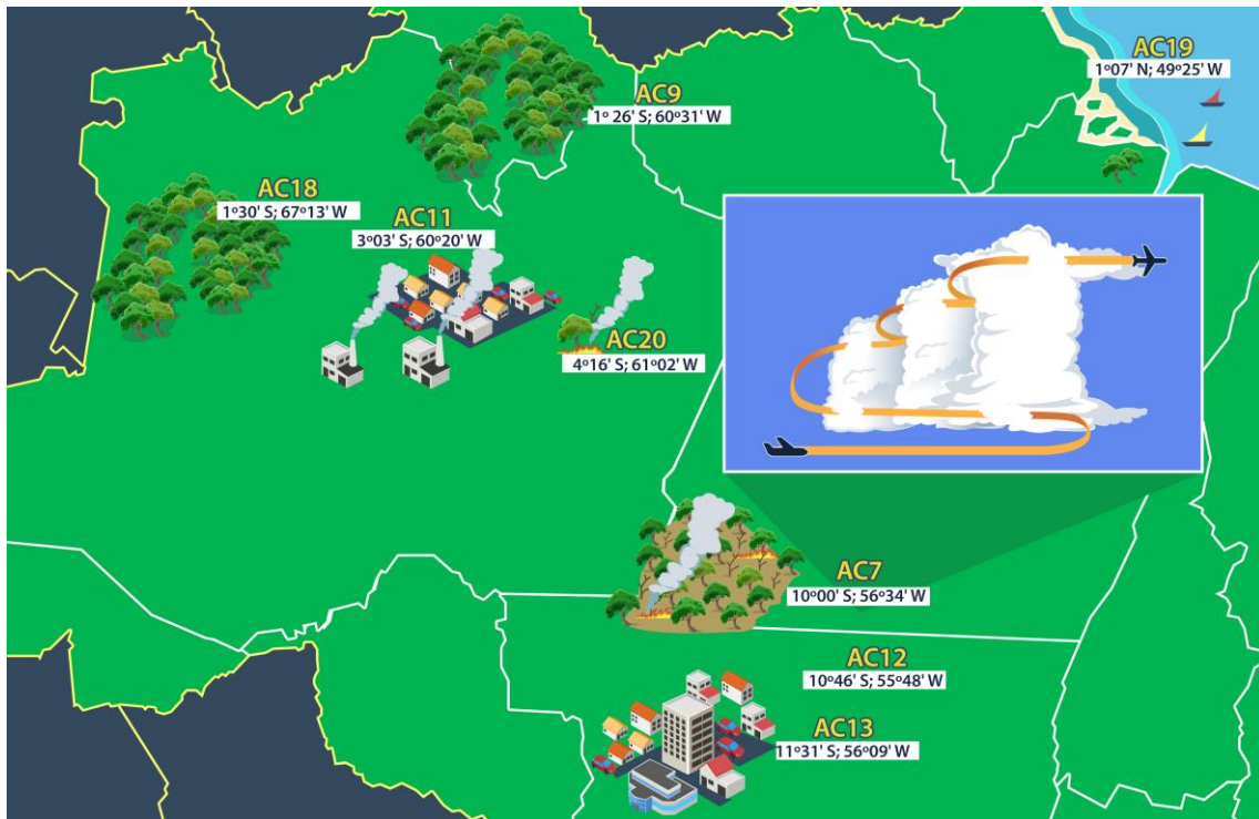
Figure 1: Locations where cloud profiles have been collected for different HALO flights. Clouds formed over southern Amazonia and in the Manaus region are subject to higher aerosol loadings due to the presence of the deforestation arc and urban emissions. Clouds formed over the northern and northwestern Amazon are driven by background conditions with low aerosol concentration. During the GoAmazon2014/5 IOP2, maritime clouds were also profiled on the Atlantic coast.