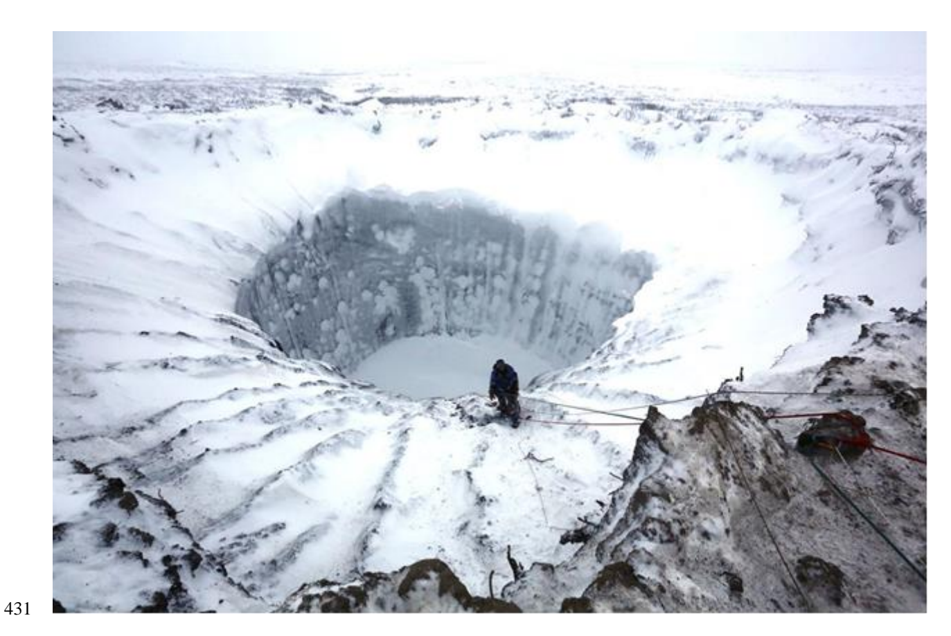
Figure 3: New crater produced by gas explosion on the Yamal Peninsula in 2014 (Leybman et al., 2015; photograph

433 by Vladimir Pushkarev borrowed from "Siberian Times").