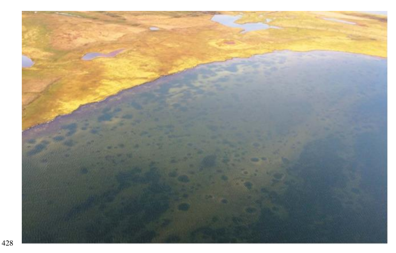
Figure 2: Photo of a lake on the Yamal Peninsula showing numerous craters from gas explosions on the lake bottom (Bogoyavlensky, 2015).