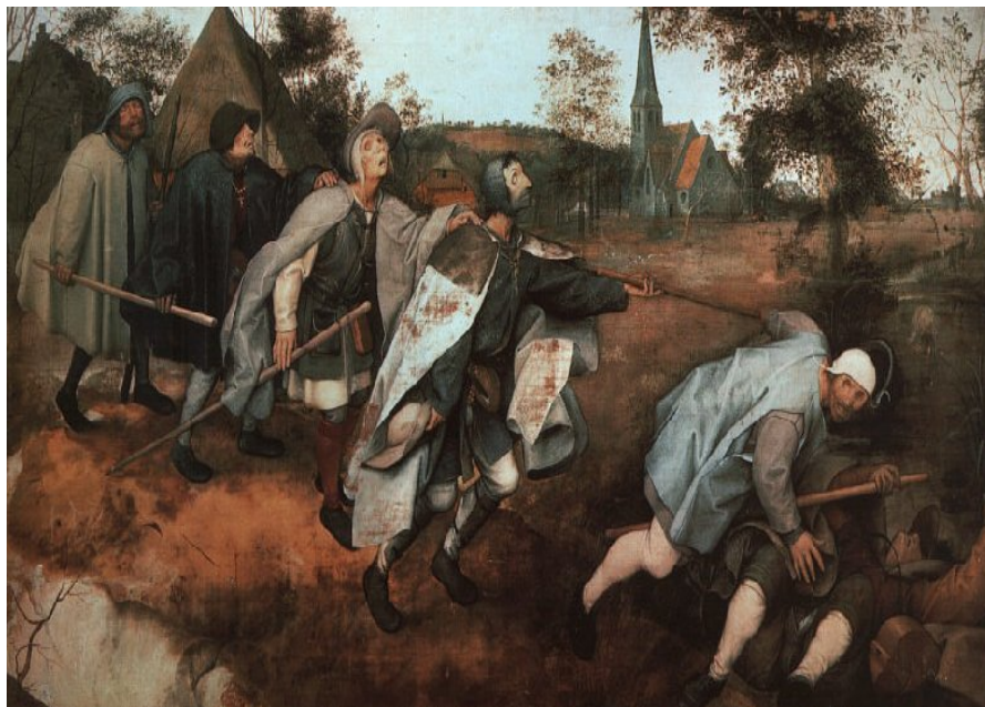
Fig. 3. “The parable of the blind leading the blind”, by Peter Bruegel The Elder, (1568), courtesy of the Museo e Gallerie Nazionali di Capodimonte, Naples.