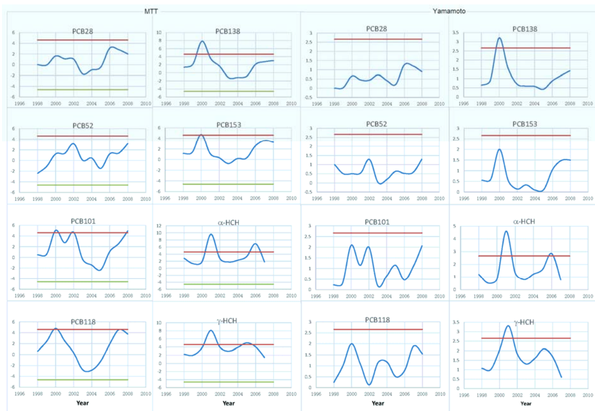
Figure S3. Same as Fig. S2 but for Pallas monitoring station.