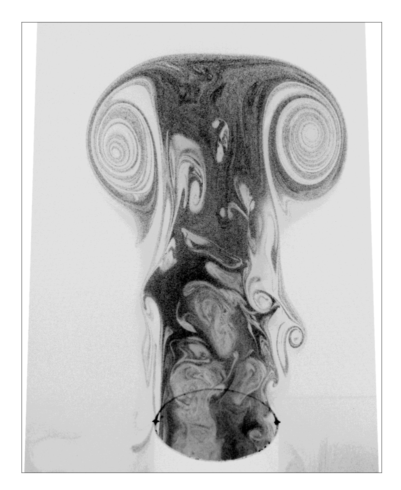
Fig. 1. A cross section of a thermal plume generated in a laboratory with use of a humidifier as a buoyancy source. Distribution of condensed water is shown by gray tone.