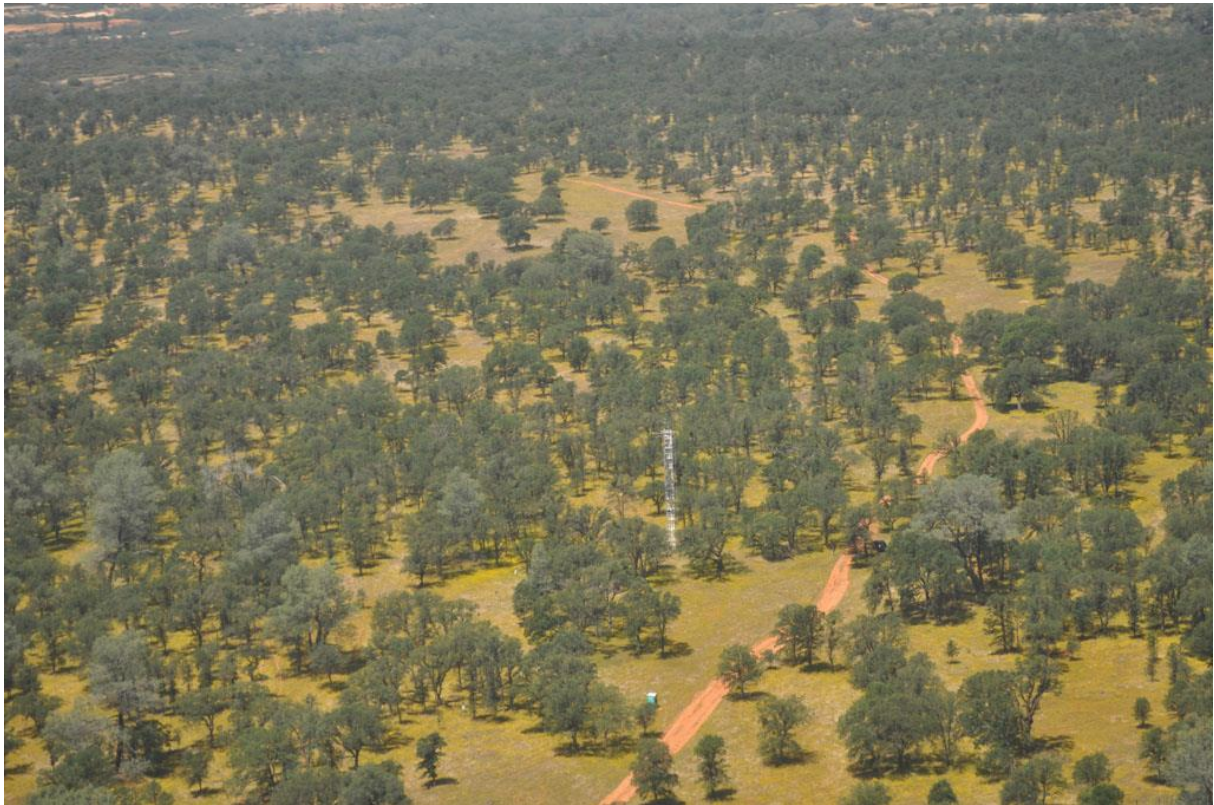
Figure S1. A typical oak savannah ecosystem seen from the twin-otter. Note spatial variability in oak densities. The photo is showing the Tonzi Ranch tower, where REA flux measurements took place (see Sect. 3.2.2).