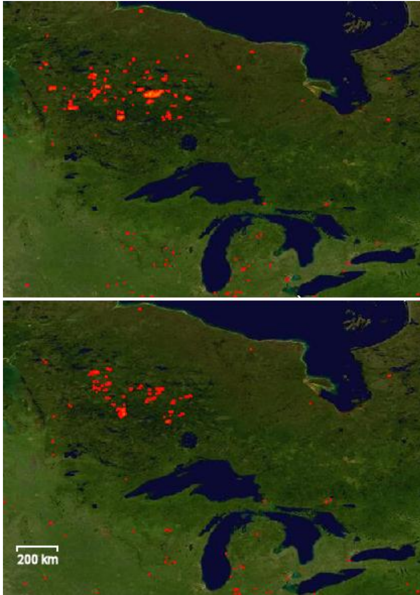
Figure S2: MODIS fire maps showing the reduction in fire activity in northwestern Ontario between the 10 day periods of 10/07/2011 – 19/07/2011 (top) and 20/07/2011 – 29/07/2011 (bottom).