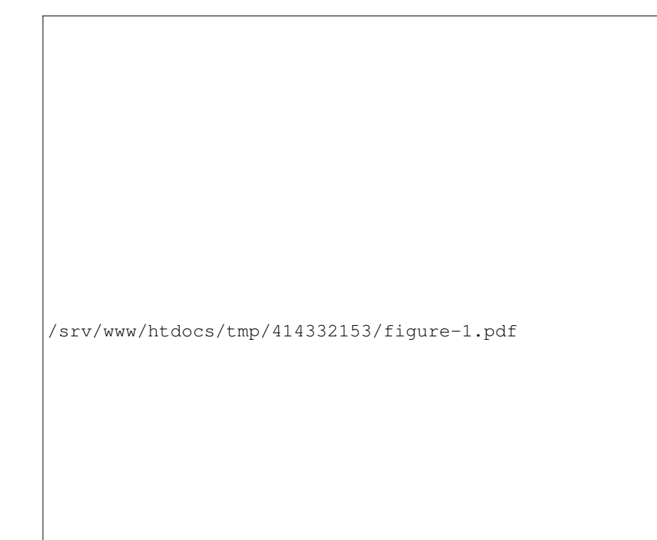
Fig. 1. Table 1