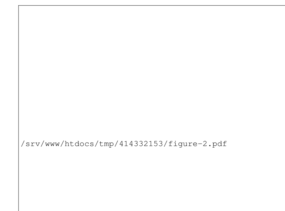
Fig. 2. PAN generation1