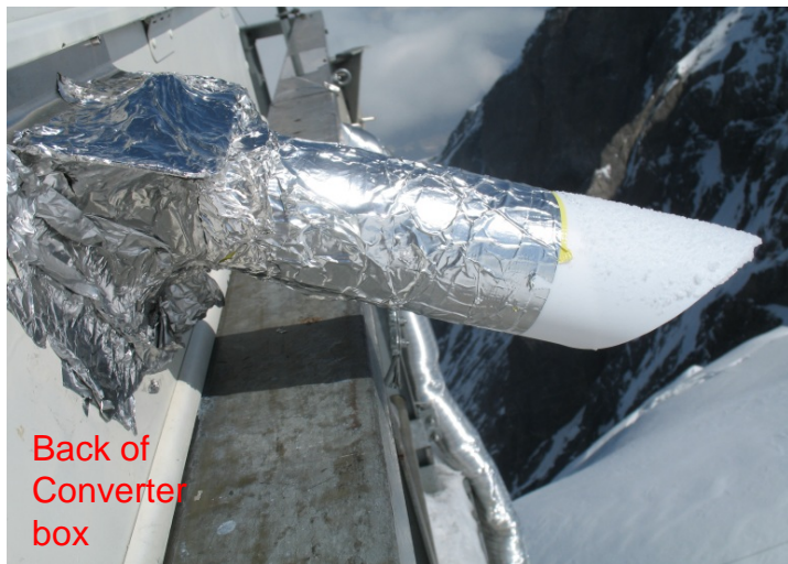
Campaign (ETH) sampling inlet