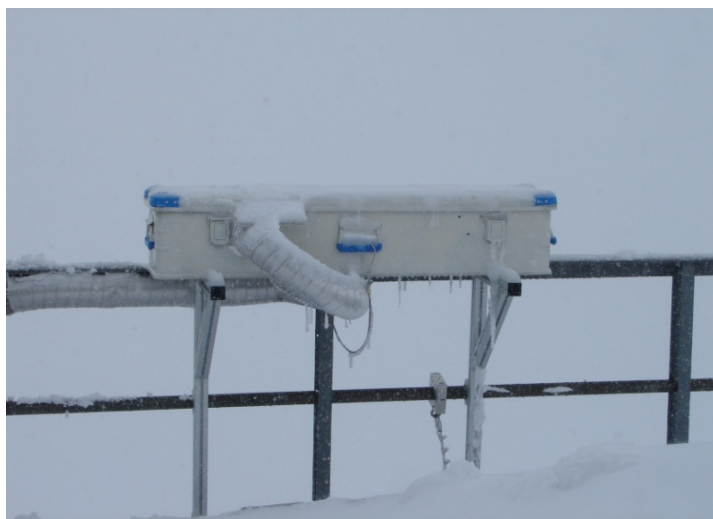
Campaign gold converter box and sampling inlet (back side)