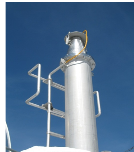
Snow in the inlet (left) and EMPA's NO y sampling inlet (right)