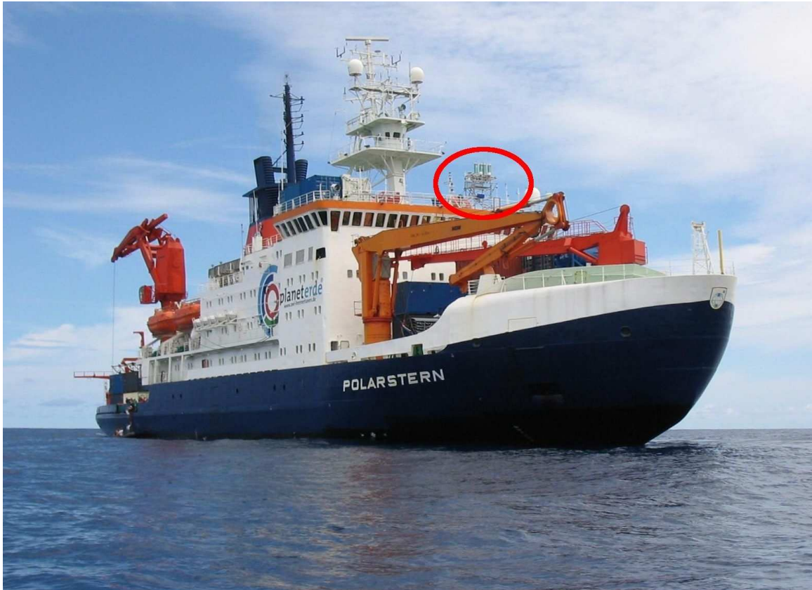
Figure S1a. Sampling gear deployed above the navigation bridge on the ship.