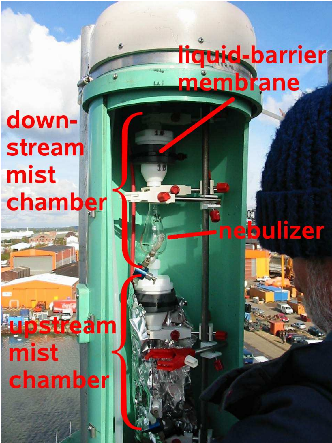
Figure S1c. Tandem mist chamber samplers mounted within housing.