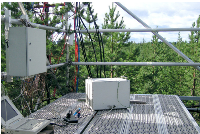
Fig. 1. BSMA2 (in the center of the picture) between pine tops.

despite the fact that it is not exactly proportional to the diffusion coefficient of air ions. The steady state equations of the cluster ion concentration in the new terms are