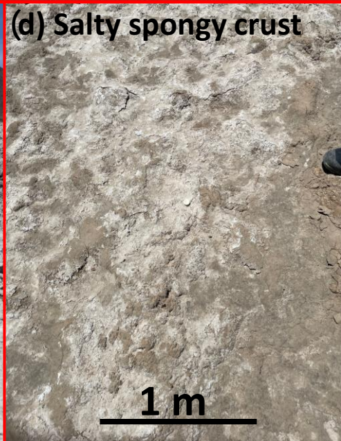
(d) Salty spongy crust