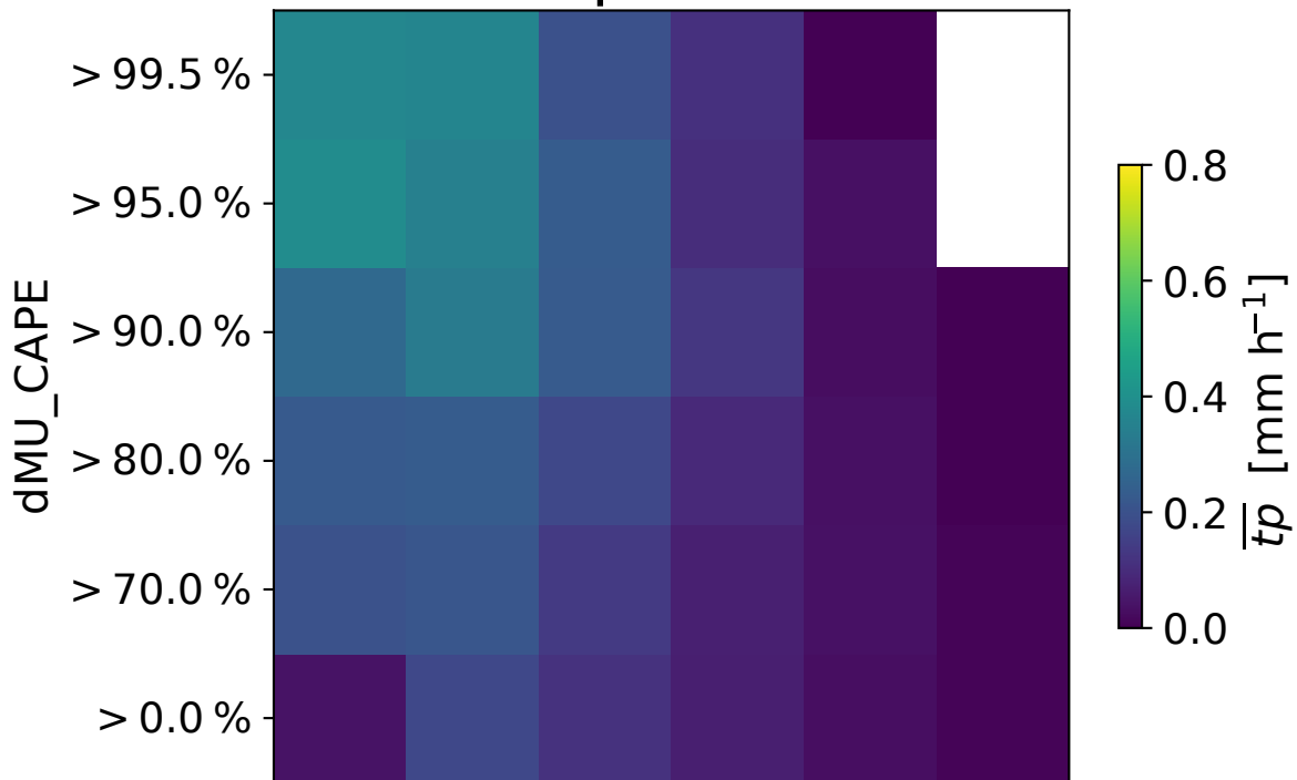
(a) Overpass time